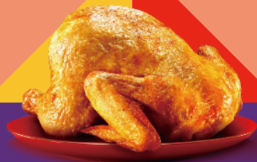
Juicy Whole Chicken