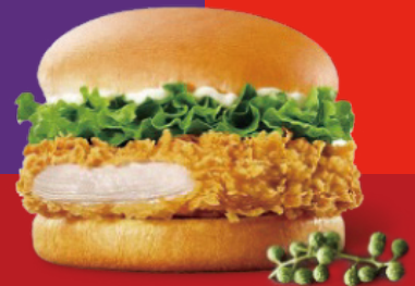
Golden SPA Chicken Burger