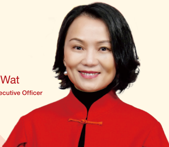
Joey Wat Chief Executive Officer