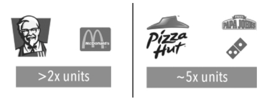
Strong Presence in 1,100+ Cities, 2 Billion+ Consumer Visits a Year

<u>High-quality, great-tasting food, including local favorites with compelling value and a Western experience</u>. Our KFC and Pizza Hut Casual Dining brands offer consumers a Western menu and experience, while also providing menu items that appeal to local taste preferences. Moreover, we provide our guests a clean and attractive dining destination. Our menus focus on providing our customers great food at a great value.